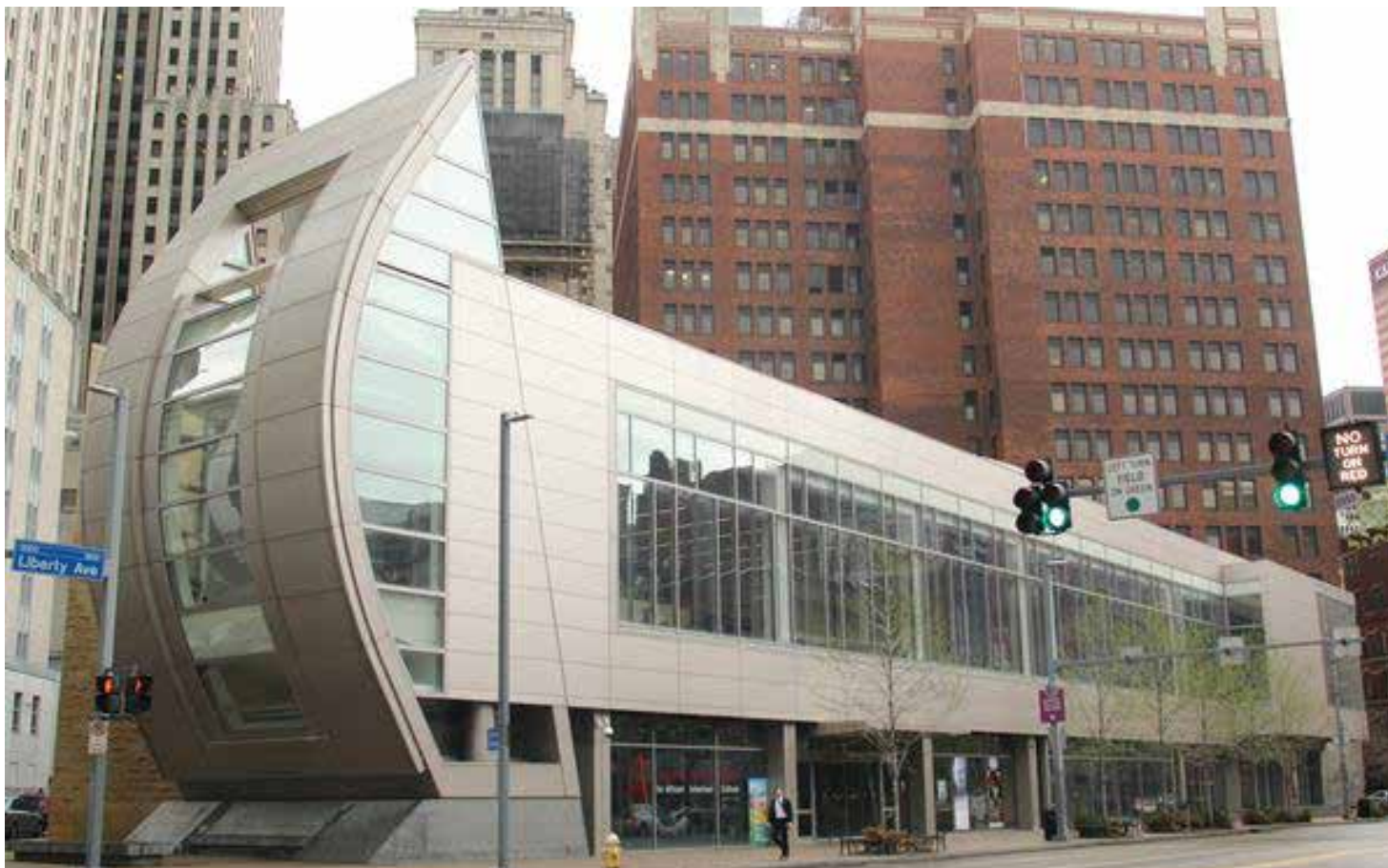
The August Wilson Center for African-American Culture in downtown Pittsburgh.